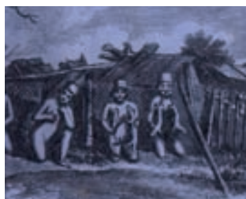
INDIAN BURIAL GROUND NEAR VICTORIA

Project partners include: the Esquimalt and Songhees Nations, the City of Victoria, Government of Canada, Department of Canadian Heritage, Cultural Capitals of Canada Program, the Province of British Columbia, the Provincial Capital Commission, the Greater Victoria Harbour Authority, and the Union of British Columbia Municipalities.