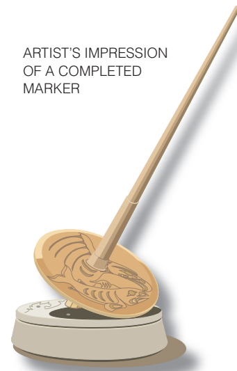
ARTIST'S IMPRESSION OF A COMPLETED MARKER