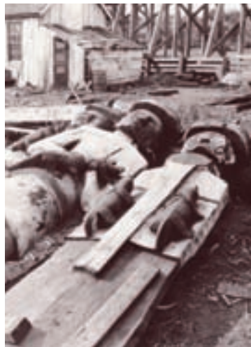
CARVED HOUSE POSTS ON THE OLD SONGHEES RESERVE